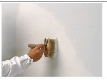
Brush applied priming coat (cross-coat) or intermediate coat if necessary.

ArteLasur is adjusted ready-to-use and should be applied undiluted. Recommendation: Apply the glaze with a soft brush (e.g. whitewash brush or oval-formed brush) on the full surface (short cross-coat application). After a short flash-off time, the surface can be spread/blended using a soft, dry wiper or wallpaper brush. Depending on the desired look it can be additionally coated wet-on-wet with tinted product or after drying of the first shade. A second glaze application enhances colour intensity, number of bright particles and loading capacity of the surface. A second application of ArteLasur (without tinting) enhances the number of particles and colour intensity.