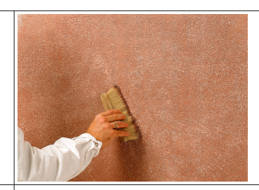
After a short flash off time the surface is spread/blended using a soft, dry wiper or brush to enhance the effect of bright particles.